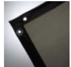
Gray See-Thru (14 mil)