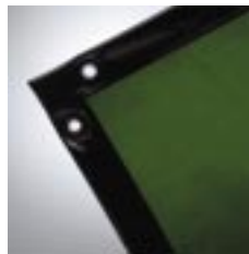
Plasma See-Thru (Dins #32504)