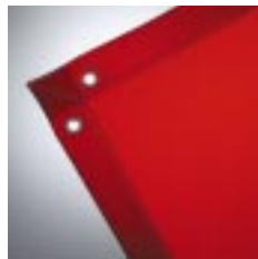
Spectra Orange See-Thru (14 mil • 40 mil)