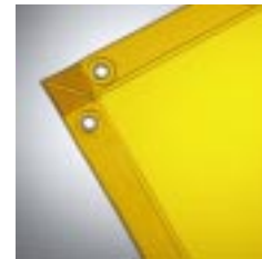
Gold See-Thru (14 mil • 40 mil)